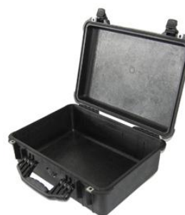
Cable plastic case