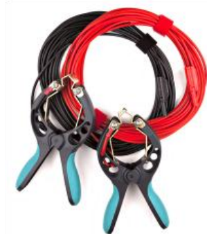
Voltage Sense cables with TTA clamps