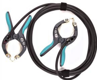
Current connection cable with TTA clamps