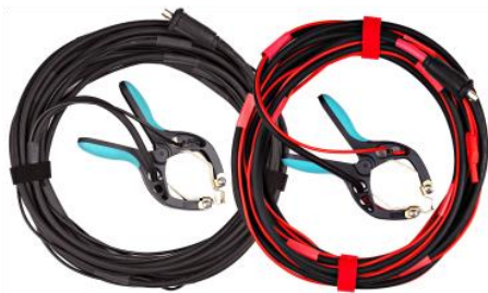
Current and Sense cables with TTA clamps