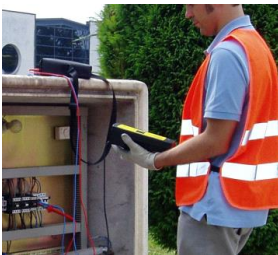
Signal injection in a power-box using the IC1G transmitter (TX)

Ariadna Instruments has developed the IC1G, an ultraportable Cable Identifier which is used in LV distribution cables for positive cable identification.