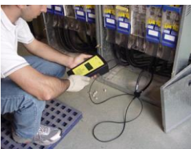
Cable identification in the LV output of an MV/LV transformer using the IC1G receiver (RX)

The graphic display shows voltage at signal injection point (TX), current (RX), received signal polarity (RX) and battery information (TX and RX).