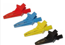
Crocodile clip red / blue / yellow / black

WASONREOGB1 WASONBUOGB1 WASONYEOGB1 WASONBLOGB1 WASONBLOGB3