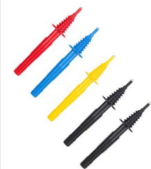
Pin probe (banana socket) red / blue / yellow / black B1 / black B3

WASONREOGB1 WASONBUOGB1 WASONYEOGB1 WASONBLOGB1 WASONBLOGB3