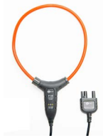
Flexible clamp F-16