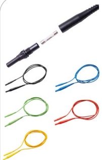
Test lead 2 m with 10 A fuse CAT IV 1000 V black / blue / green / red / yellow

WAPRZ002BLBBF10 WAPRZ002BUBBF10 WAPRZ002GRBBF10 WAPRZ002REBBF10 WAPRZ002YEBBF10