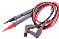
Set of test leads CAT IV, M