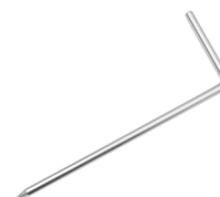
4 x earth contact test probe (rod), 25 cm WASONG25