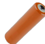
4 x alkaline battery 1.5 V AA, LR6