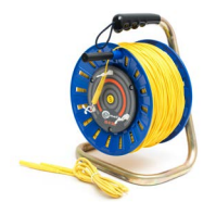
Test lead 200 m, yellow, for MRU (banana plugs, on a reel) WAPRZ200YEBBSZ