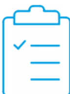
Calibration certificate issued by an accredited laboratory