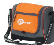
M6 carrying case WAFUTM6