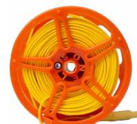
Test lead 50 m for MRU (banana plugs, on a reel), yellow WAPRZ050YEBBSZ