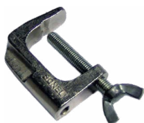
Cramp (banana plug) WAZACIMA1