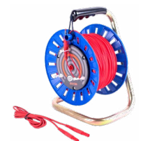
Test lead 100 m, red, for MRU (banana plugs, on a reel) WAPRZ100REBBSZ