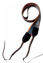
M1 hanging straps WAPOZSZE4